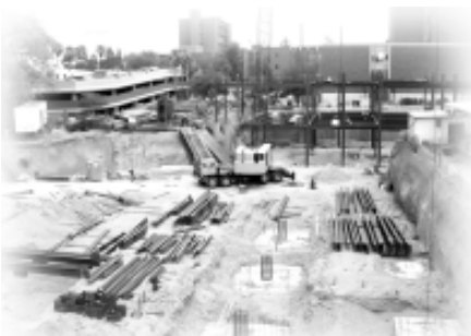
Underground loading dock begins to take shape.

Stay tuned for further updates. Enjoy the rest of your summer. And thanks for all you do! ■