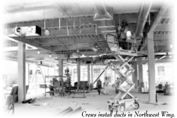
Crews install ducts in Northwest Wing.

A. The northwest portion of the new building is on schedule and move in for the Bookstore and some Student Union Departments could happen as early as the end of November. The eastside portion of the project is behind schedule due to some steel delivery problems.