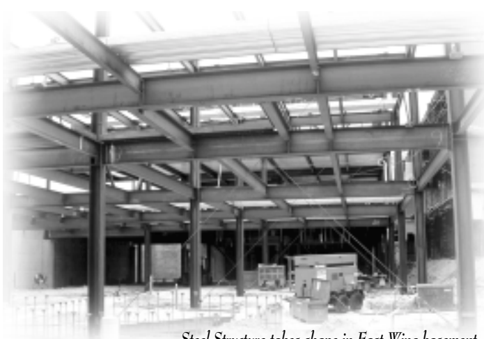
Steel Structure takes shape in East Wing basement.

There are ongoing discussions about when we would move in. Right now, the original date of December 18, 2000 does not seem feasible. This will affect Dining Services and retail operations (Fast Copy, All-Aboard, University Photo Center, Cat Card Office, and Post Office). It will also affect areas such as the Information Counter, Housekeeping and Maintenance.